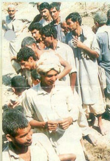
Household heads queuing up for food rations.