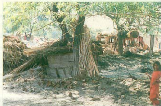
The Homes of village TOOTAN demolished by flood waters.