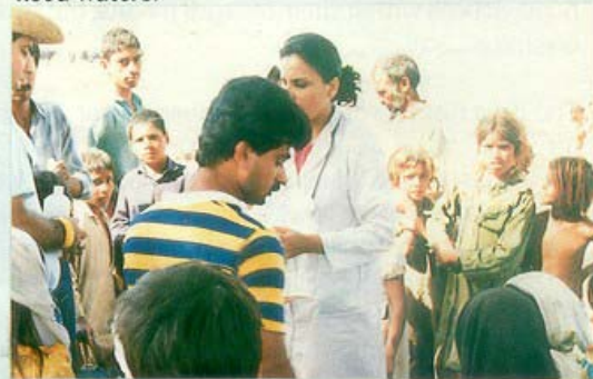
Our team of doctors giving medical aid.