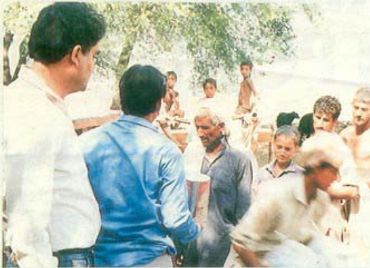
Distribution of food rations.